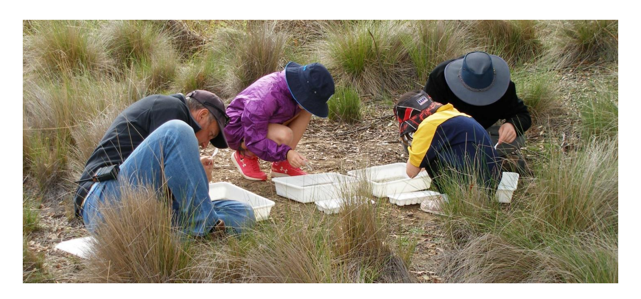
Southwell Cubs and Venturers@ Namadgi NP