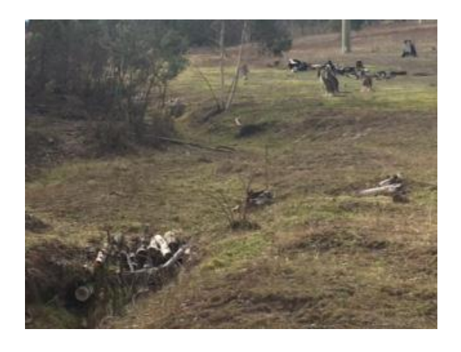
Logs holding soil in gullies on Farrer Ridge Nature Reserve.