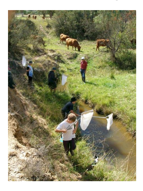
Duffy PS students @LYH

On a much needed positive note a number of exiting school events happened over the last few months including a mini Catchment Health Indicator Program project by the Yr11 Ecology students at McKillop College. Your Waterwatch Coordinator delivered a sizzling series of workshops for teachers as part of the 'STEMEd' conference and Gordon Primary School's delightful Yr4/5 classes all did a mini CHIP assignment, using bugs and basic water testing at Point Hut Pond. Other schools got involved in the autumn 'BugBlitz' including Southwell Venturers and Cubs, Woden School, Lake Tuggeranong College, and Duffy Primary School. Our usual hard working students at Caroline Chisholm School and Lions Youth Haven continued to keep the water quality data coming.