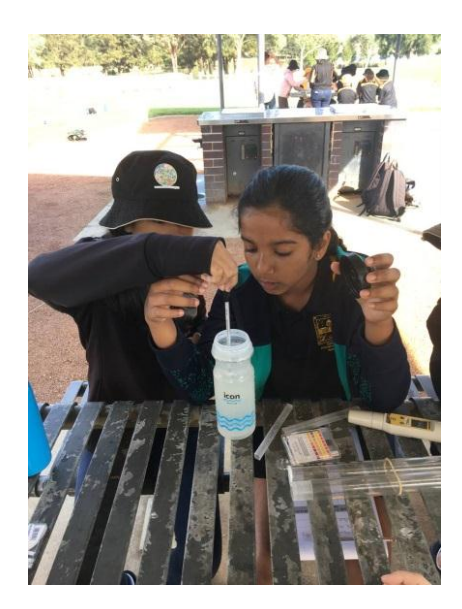
Gordon PS students

A huge thank you to all those groups and individuals involved in collecting data. To view Upper Murrumbidgee Waterwatch data go to <a href="http://www.act.waterwatch.org.au">http://www.act.waterwatch.org.au</a>.